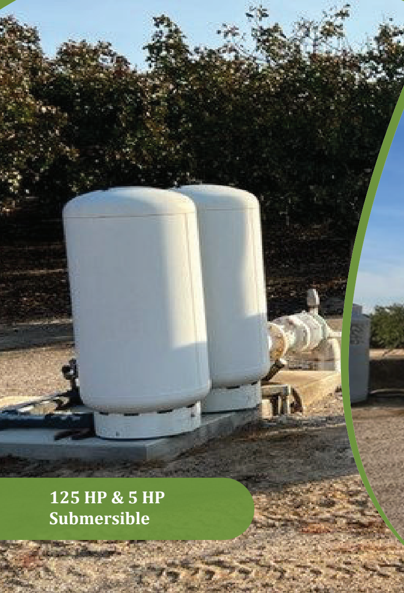
125 HP & 5 HP Submersible