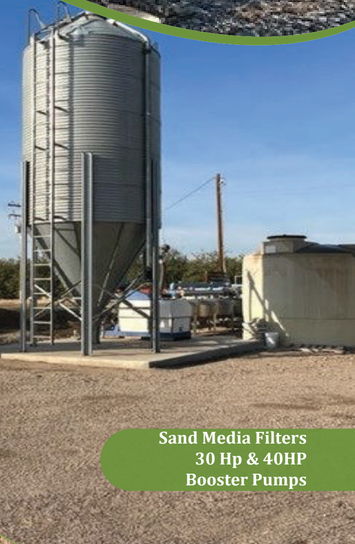
Sand Media Filters 30 Hp & 40HP Booster Pumps